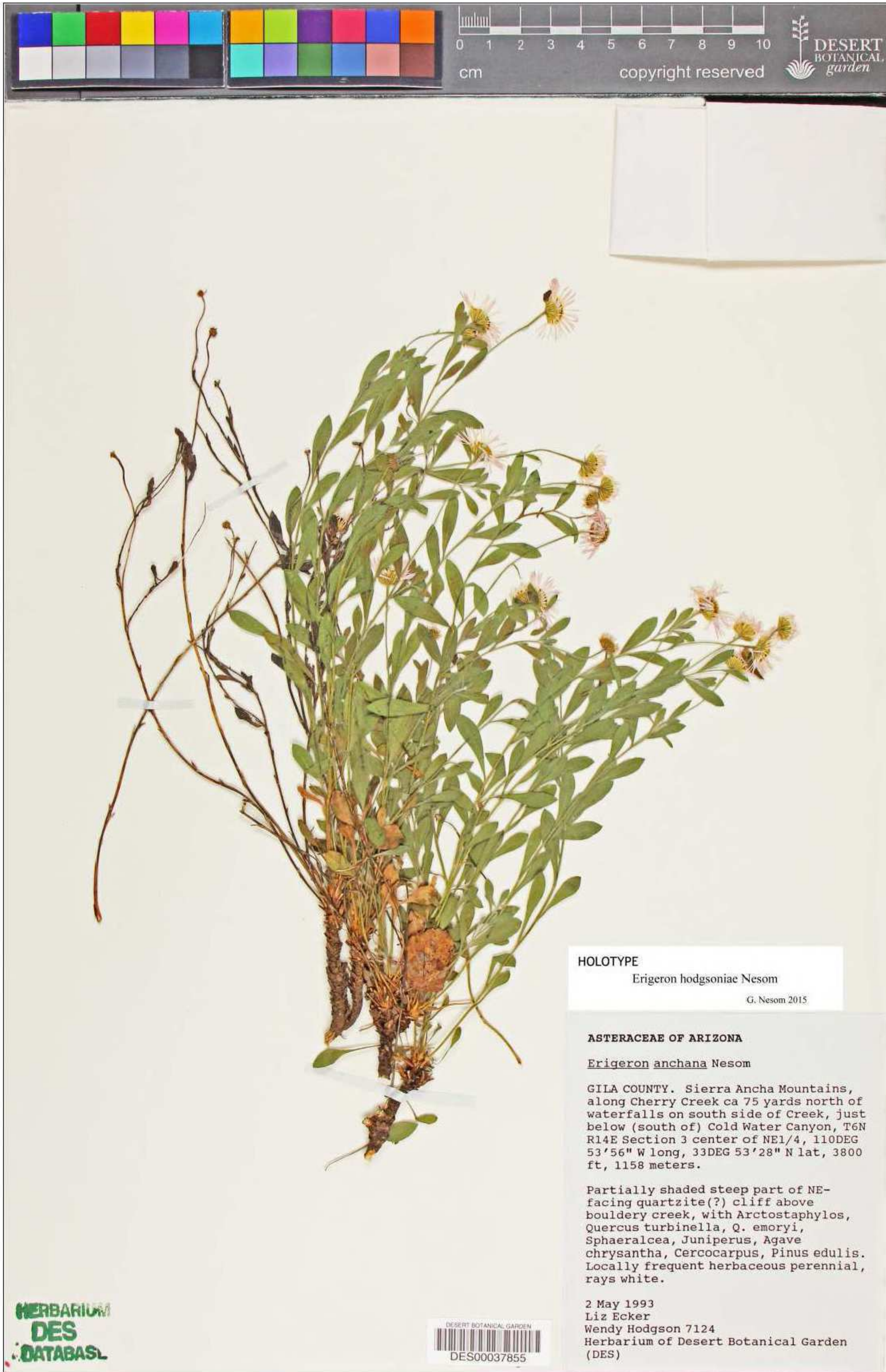
Figure 2. Holotype of Erigeron hodgsoniae , DES.